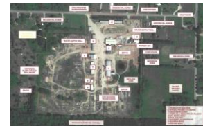
GasTechno Energy Center located in Boyne Falls, Michigan for R&D, and manufacturing GTL plants