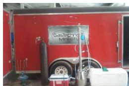
Modular Mini-GTL® patented tech system is developed