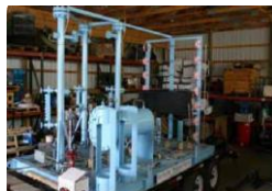
First innovative Gas-to-Liquids (GTL) prototype