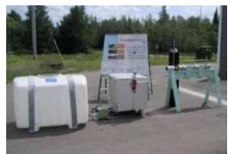
Gas Technologies LLC was founded