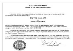
GasTechno Corp was founded