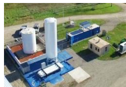
Commercial start and tech validation of first plants