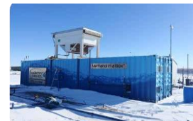
Production of NGL's and methanol from associated flare gas in North Dakota