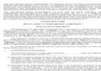
GasTechno Corp Issued Regulation S Offering